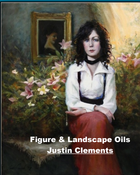
Figure & Landscape Oils Justin Clements