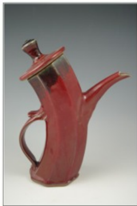
Can it be shipped? Just Ask!