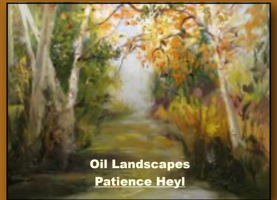
Oil Landscapes Patience Heyl