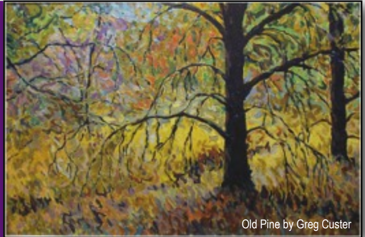
Old Pine by Greg Custer

©2017 copyright Sharon Wolff. To copy this material to other publications or mailing lists, please request permission