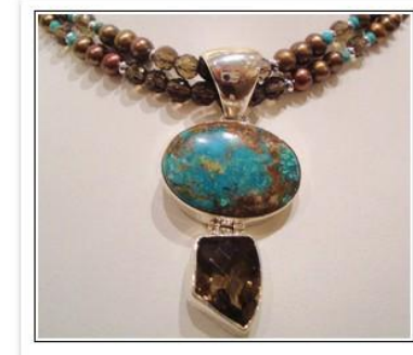
Ronee DelBianco Design Turquoise, Smoky Quartz, Freshwater Pearls